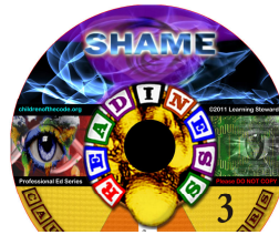
Readiness Confusion & Shame