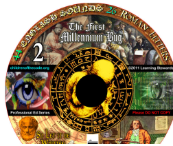
The History of the Code