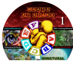
What's At Stake What is Reading?

Attendees of events using COTC videos receive a 33% discount on any one or all of our "Essentials" DVDs or on our complete 4 disc Professional Development Series.